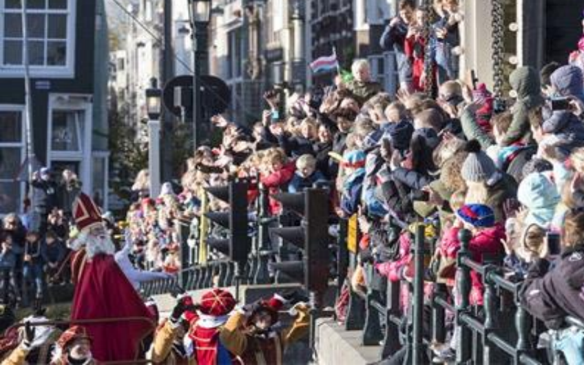
The Sinterklaas Parade