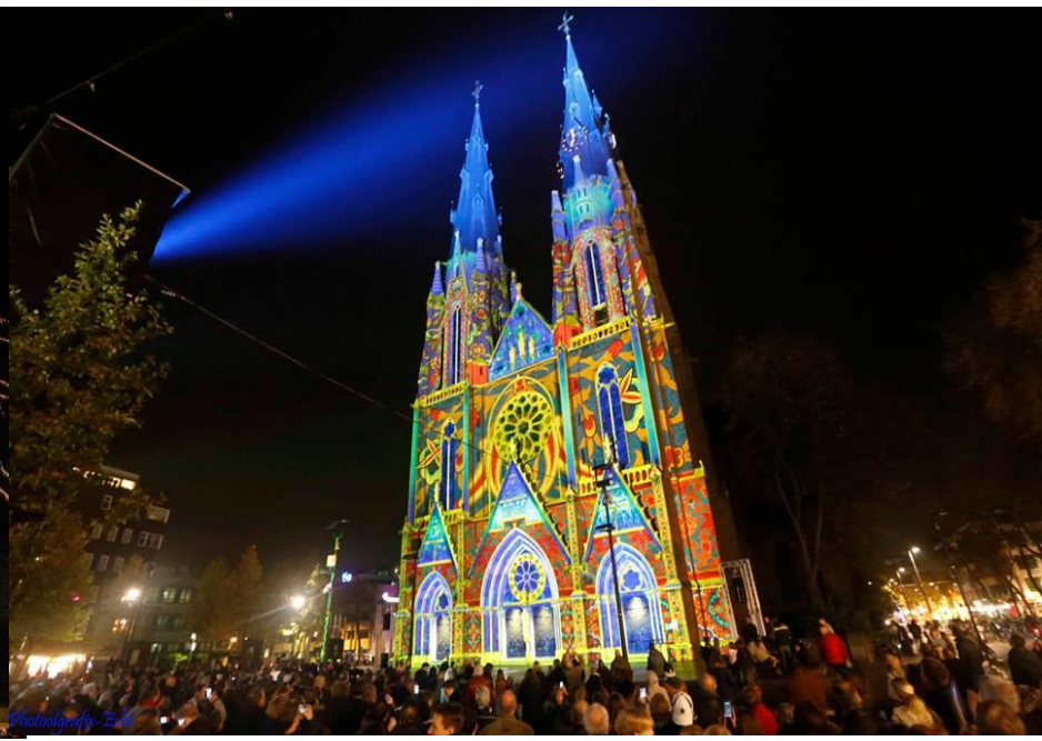
Catharina Church, GLOW Festival