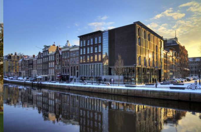
Anne Frank House