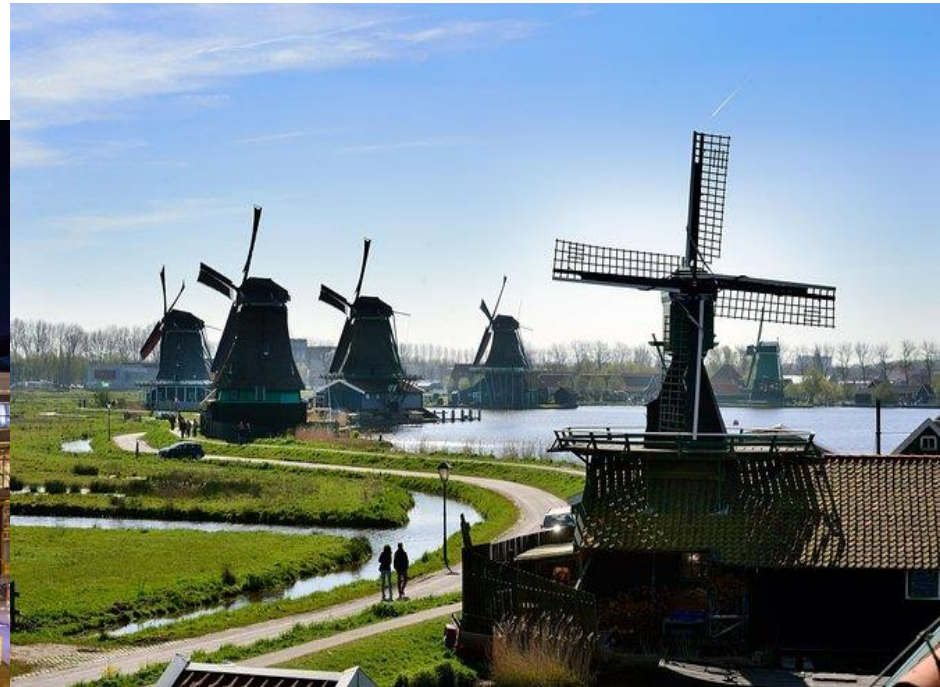
← Drie Gezusters Pub