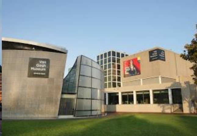
Van Gogh Museum