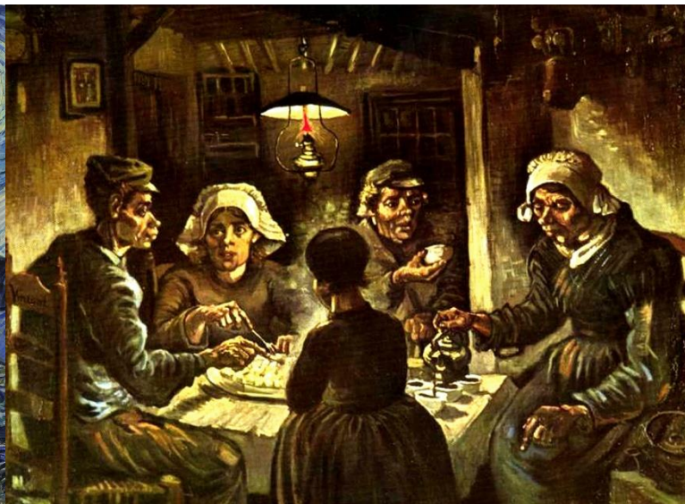
The Potato Eaters