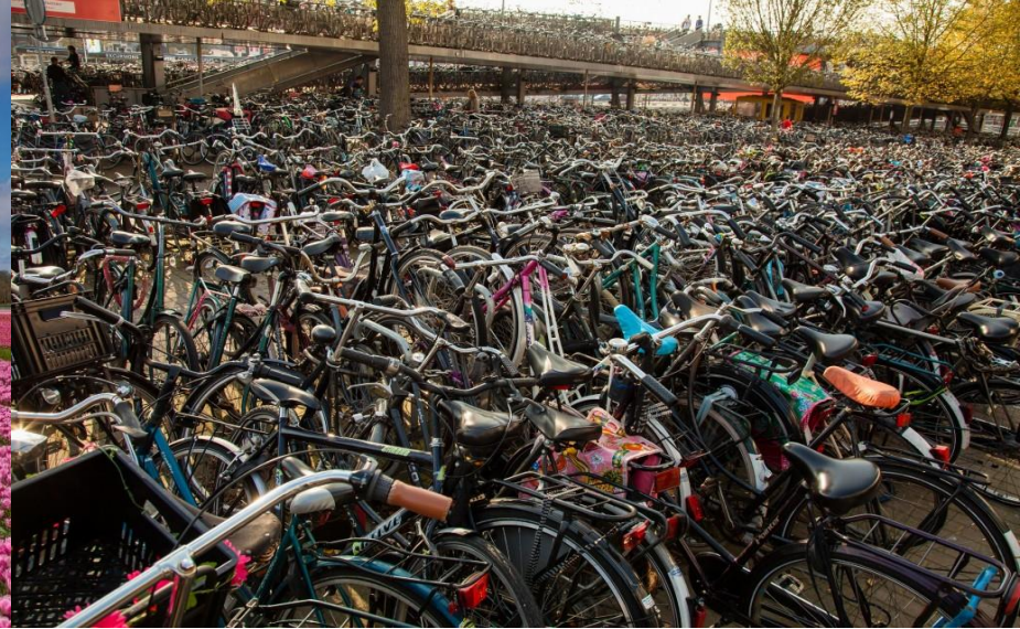
Probably Over a Million Bikes