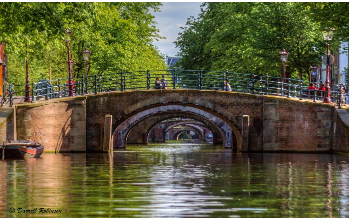
← Seven Bridges Canal