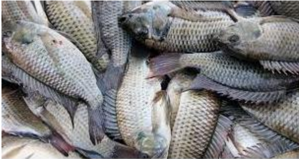
Photo: Tilapia fish