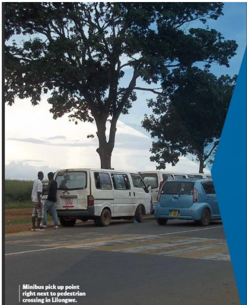
Minibus pick up point right next to pedestrian crossing in Lilongwe.