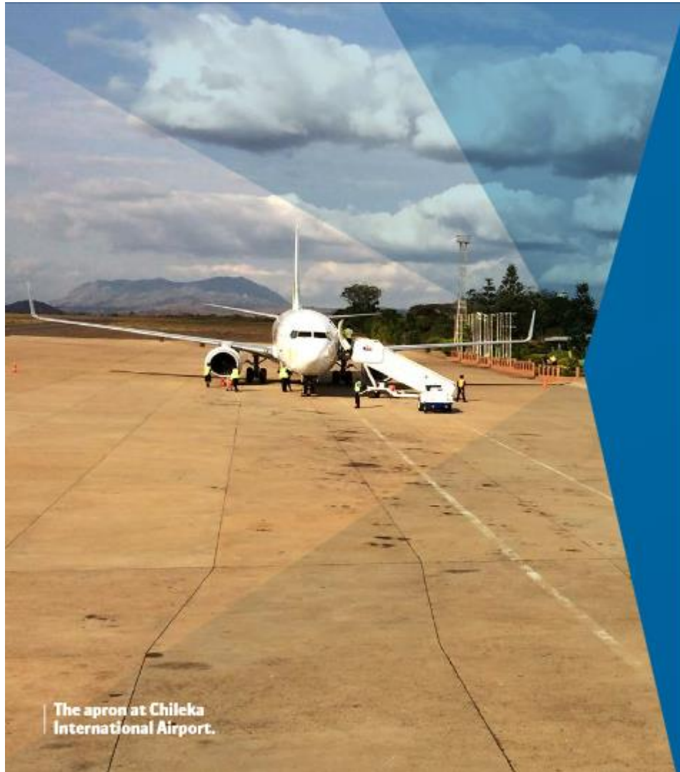
The apron at Chileka International Airport.