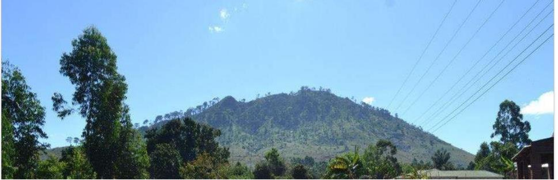
Photo: Bangwe Mountain